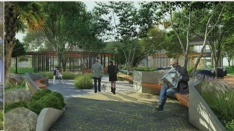
Cool Breeze & Sufficient Shading