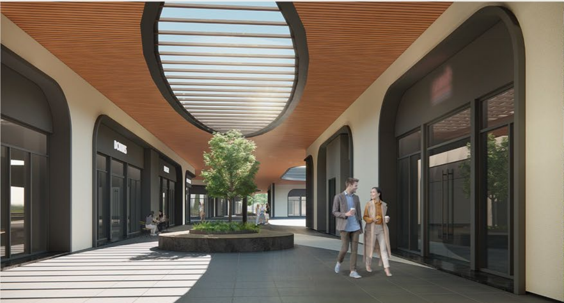
Natural Lighting & Sufficient Air-flow