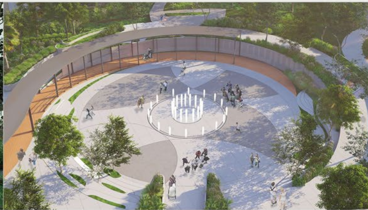
Large Common Area, Perfect for Events