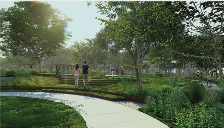
Eco-friendly & Modern Design